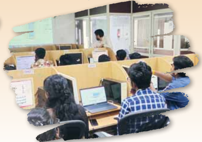
Mentoring and Counselling