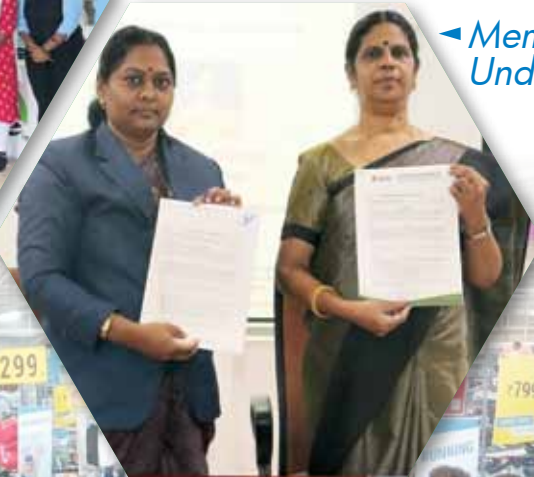
◀ Memorandum of Understanding