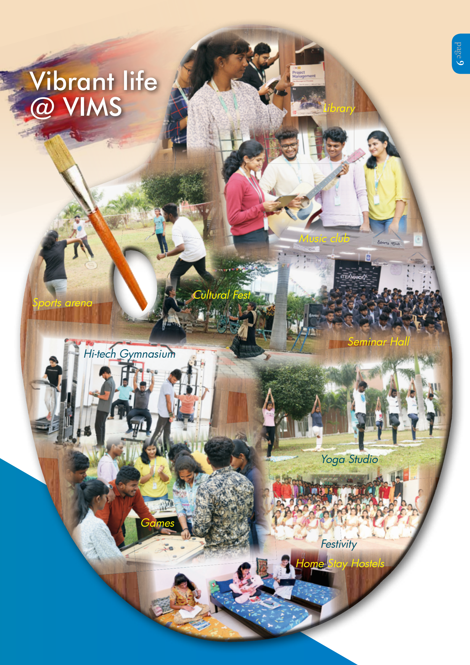
Home Stay Hostels