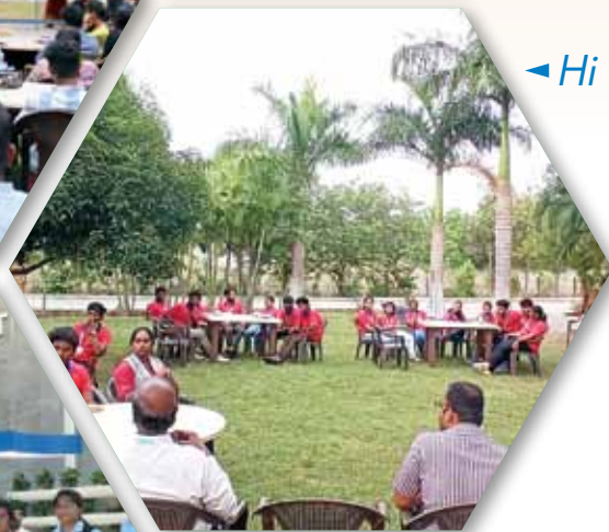
◀ Hi Tea Party